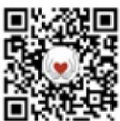
Mamatha Vidhya Nikethan Govt Aided School - Bagepalli