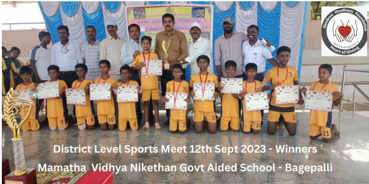
District Level Sports Meet 12th Sept 2023 - Winners

Their success underscores the belief that with dedication and belief, dreams do materialize. Mamatha Vidhya Niketan stands as a beacon of inspiration, illuminating the path for others to follow. Keep shining bright, for this victory is just the beginning of even greater accomplishments!